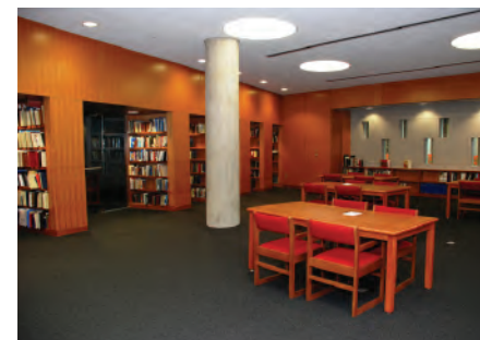
Edward Jones Research Center