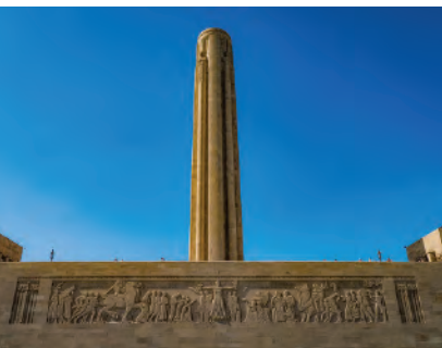
Located on the North Wall, the Great Frieze tells about the end of war and the emergence of a peaceful period.

Tour your community and list the different types of buildings you see. Try to identify buildings that can be associated with a specific period of history or style of architecture. Make a sketch of the building you most admire. Explore the exterior of the National WWI Museum and Memorial, find out detailed information on the interactive table in the east gallery and take a virtual architecture tour at theworldwar.org .