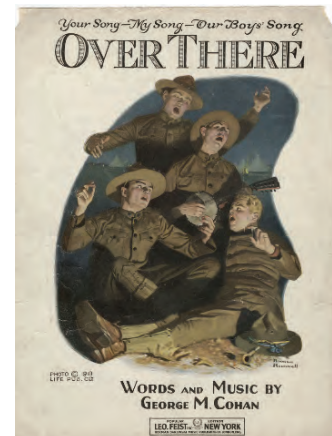
"Over There" is a classic song that inspired Americans to support the war.