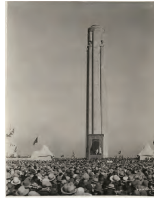
The Liberty Memorial was opened to the public in 1926 with crowds of more than 150,000 people at the dedication.