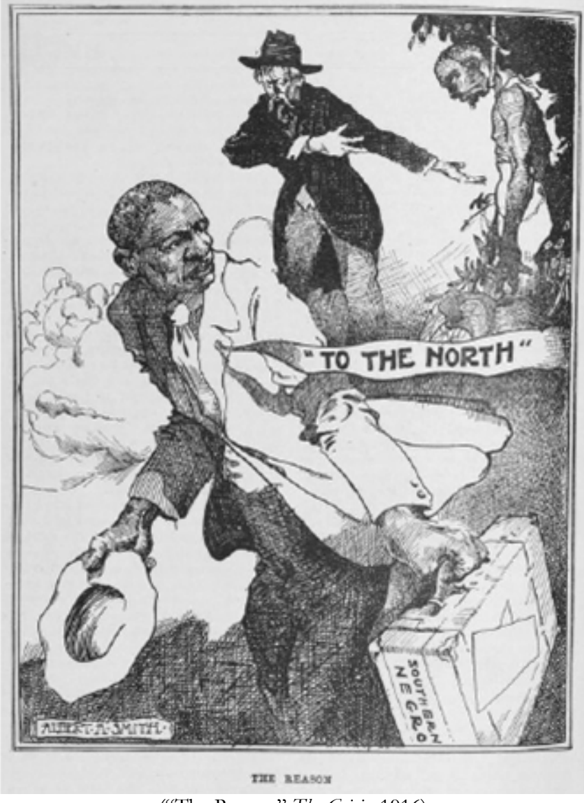
("The Reason" The Crisis, 1916)

What is this political cartoon attempting to illustrate?