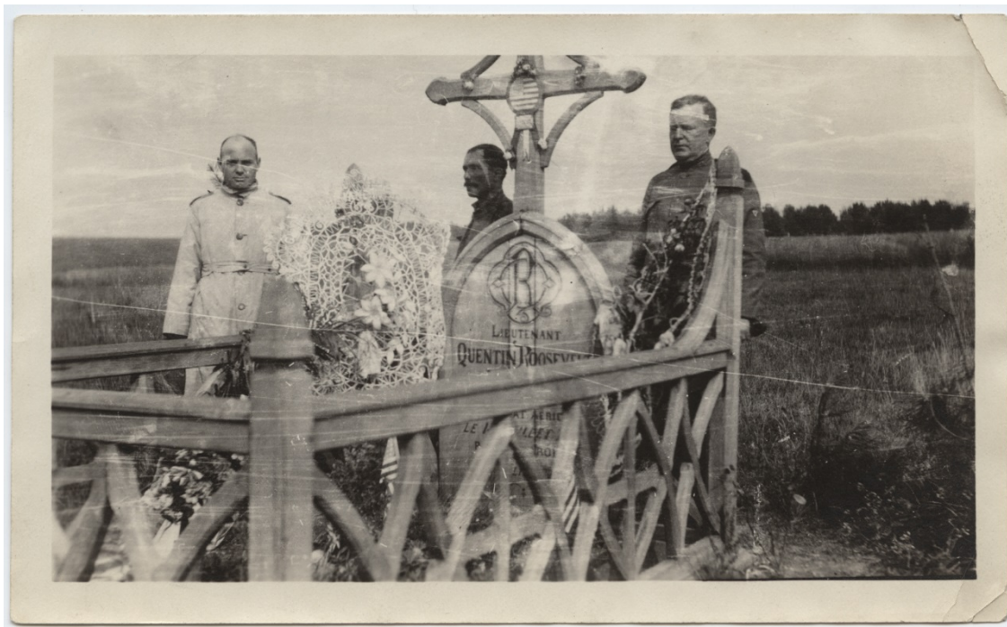
The first Americans to discover Roosevelt's grave erected a marker with Roosevelt's name and identification as a member of the "Air Service U.S.A." 10